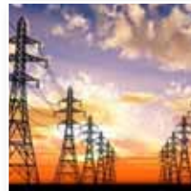
Utilities Power Generation